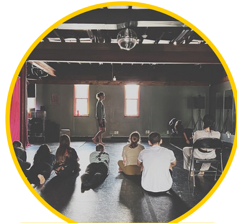
fireWALL dance theater