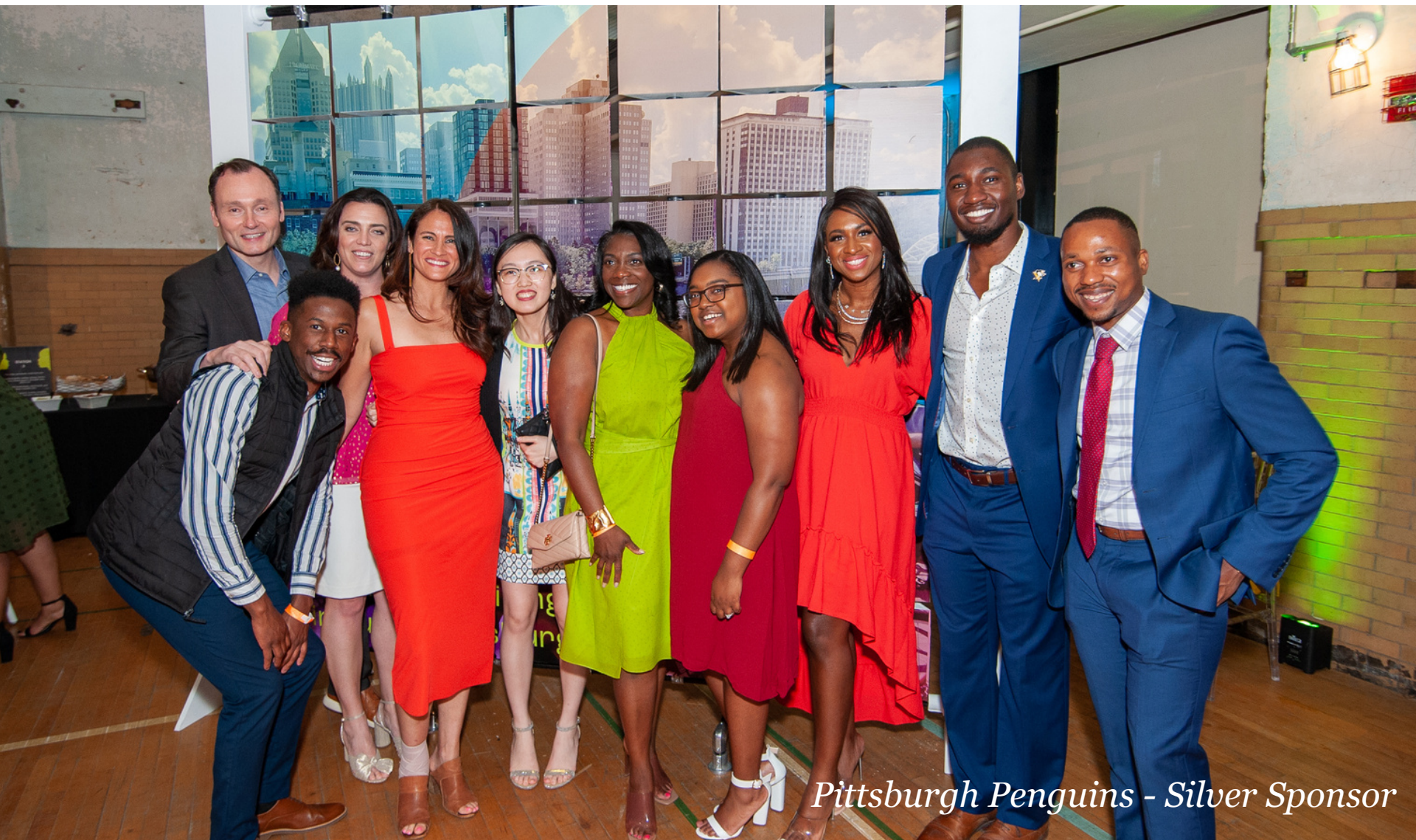
Pittsburgh Penguins - Silver Sponsor