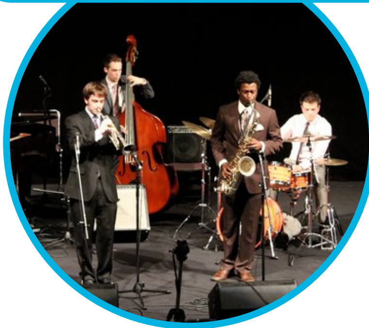
Center of Life Youth Jazz